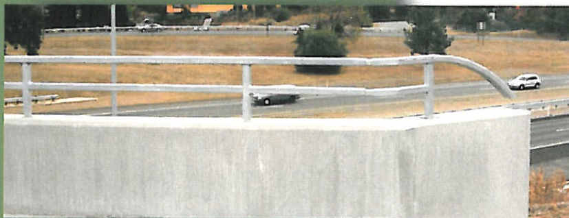
B 11-51 BARRIER RAIL