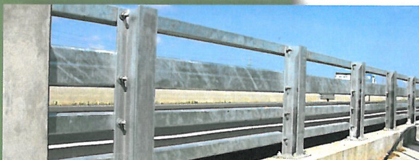
CUSTOM DESIGNS AVAILABLE OR BUILD TO PLAN

AVAILABLE IN A VARIETY OF FINISHES INCLUDING HOT DIP GALVANIZED AND POWDER COATED.