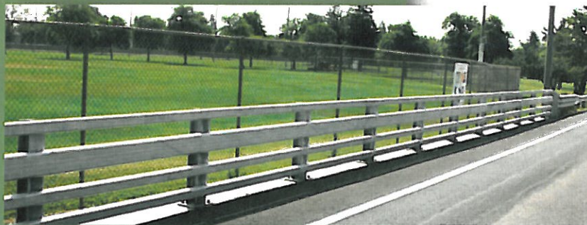
CUSTOM DESIGN BARRIER RAILING